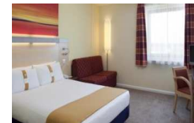
from £ 147 per person for 3 nights package

This 126 room hotel has rooms with air conditioning, Wifi, TV and hairdryers. With rooms with extra sofa beds a child U16 stays for free. There is a restaurant & bar. The hotel has car parking (£5 per day) and is within 200m of Newbury Park station on the Central Line just 6 stops to Stratford taking 15 mins.