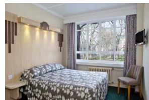
from £ 165 per person for 3 nights package

This tourist class hotel on Tavistock Square has 395 rooms with bathrooms, air conditioning, Wifi, tea & coffee facilities, and a TV. There are single rooms smaller than regular rooms and family rooms are for 3 persons to share. There is a restaurant, regular bar & wine bar. A good value tourist class option in a prime central London location.