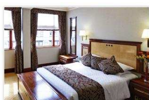
from £ 345 per person for 3 nights package