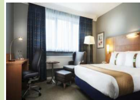
from £ 180 per person for 3 nights package

Two hotels with 300+ standard and executive rooms equipped with bathrooms, air conditioning, Wifi, tea & coffee facilities, TV with cable & film, hairdryer & 24hrs room service. Executive rooms are larger and have a mini-bar & safe. Each hotel has a restaurant, bar & coffee shop. Fitness First Health Club next to the Bloomsbury hotel with discounted rates.