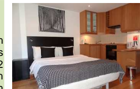
from £ 210 per person* for 3 nights package