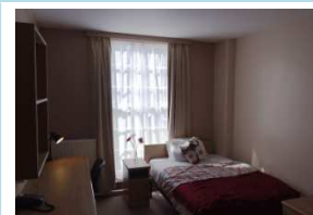
from £ 237 per single room for 3 nights package

We have access to some of the official accommodation being used by those involved with the London 2017 events which is very close to Stratford. Each room is suitable for one person in a student study style bedroom with an en-suite shower & WC. Breakfast is included. A comfortable affordable option for single travellers.