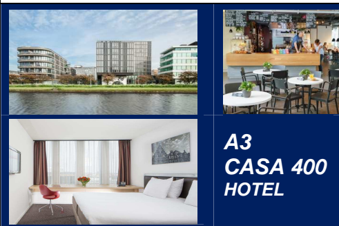
A3 CASA 400 HOTEL