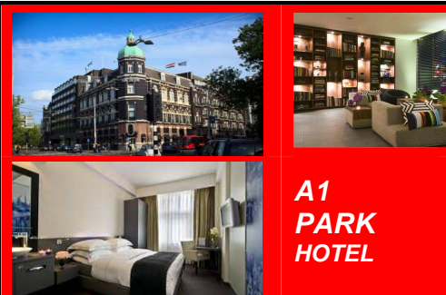
A1 PARK HOTEL