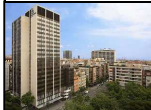
A1 BARCELONA MELIA HOTEL Barcelona Centre Sol Melia HOTELS & RESORTS