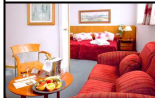
A3 ATENEA APARTHOTEL Barcelona Centre