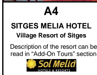
A4 SITGES MELIA HOTEL Village Resort of Sitges Description of the resort can be read in "Add-On Tours" section Sol Melia HOTELS & RESORTS